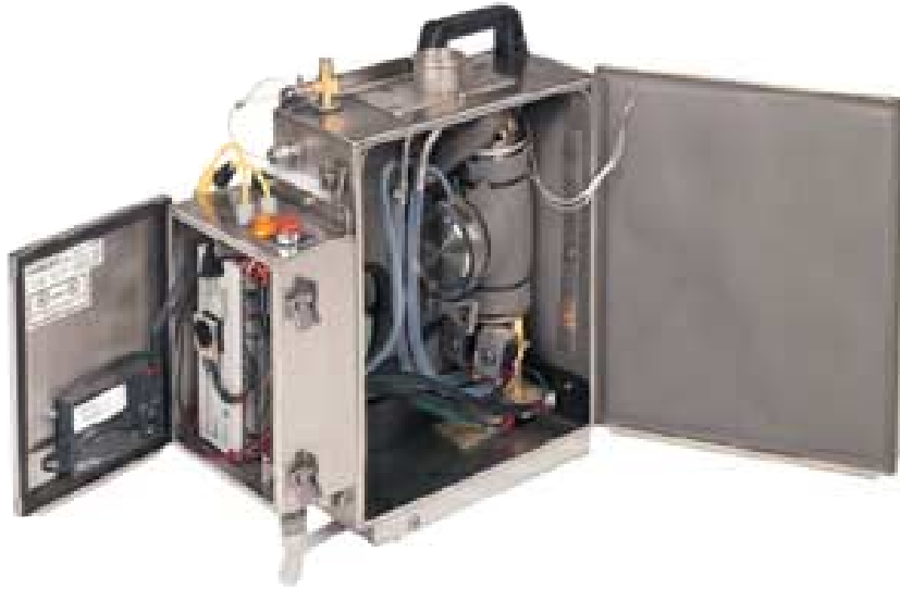
LN 2 Injector

Chart Liquid Nitrogen Injectors are designed for pressurizing or inerting bottles, cans, plastic, glass or styrofoam containers.