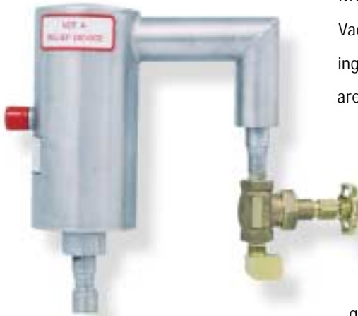
CryoVent Model A

MVE's CryoVent is the most reliable way of maintaining liquid in your Vacuum Insulated Piping systems. It will not freeze open while venting gas out of the system. It does not rely on electronic probes that are pressure or temperature sensitive. It requires no electricity.